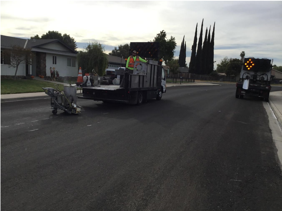
Pavement Striping and Marking