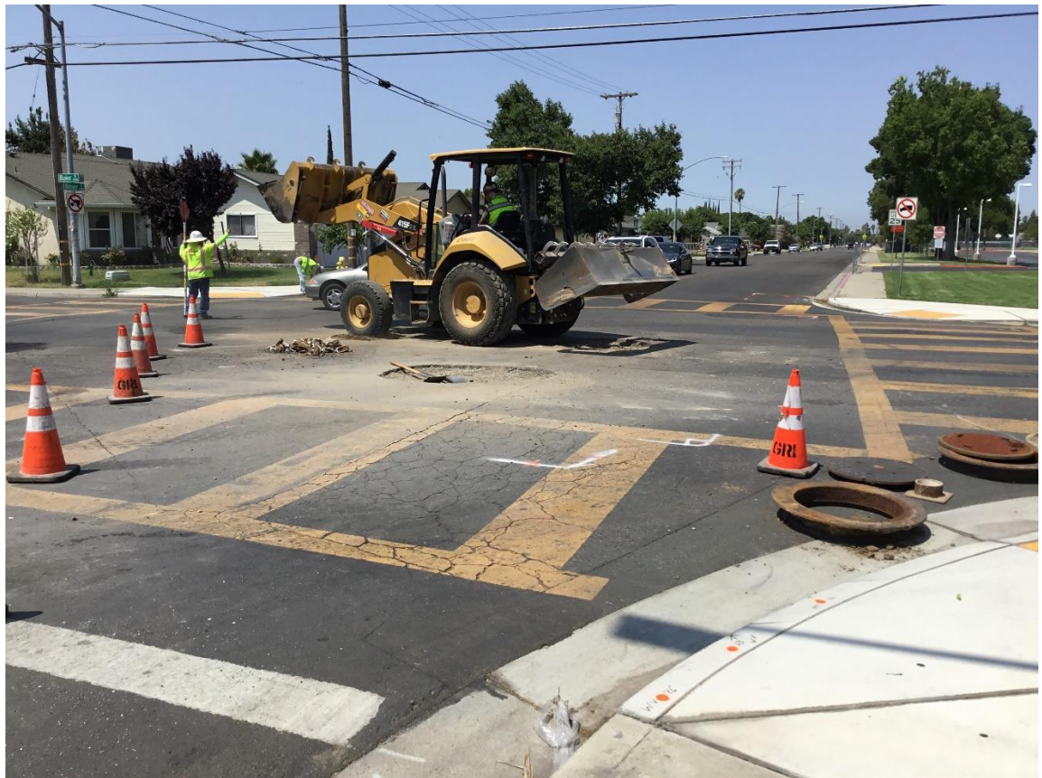
Lowering Utility Covers