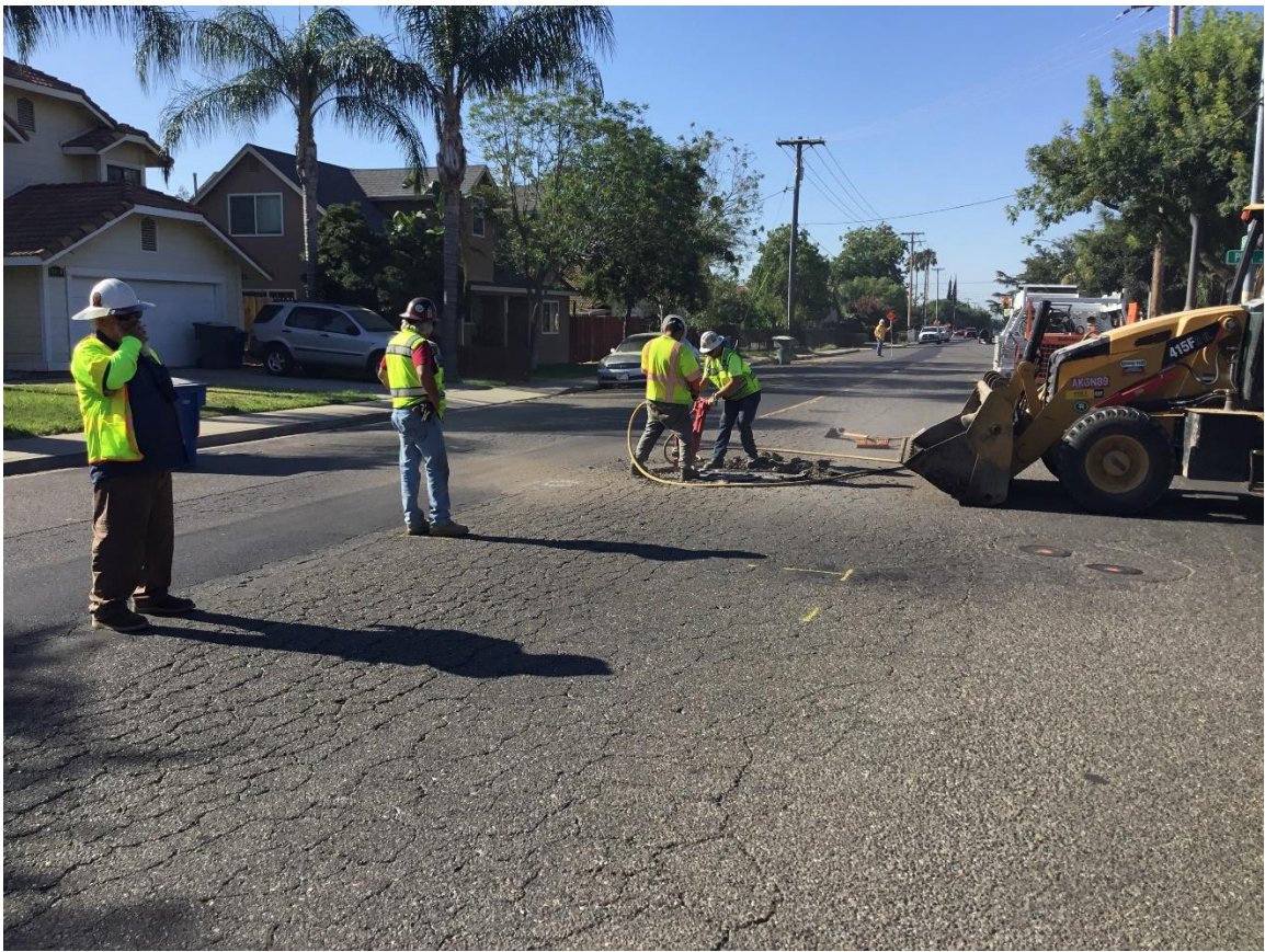
Lowering Utility Covers